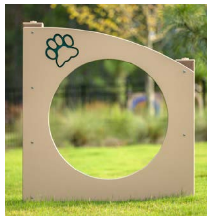
JUMP THROUGH RECF0014XX $557