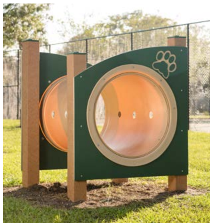
DOG LOG RECF0008XX $1,515