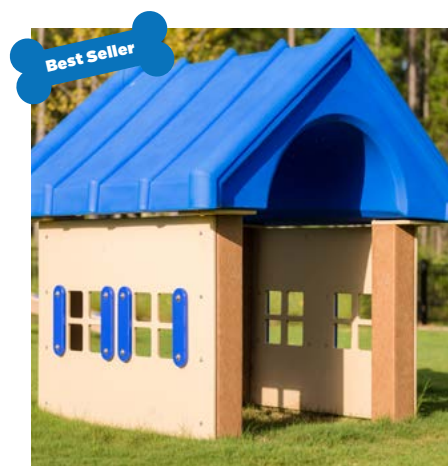
HOME SWEET HOME RECFO010XX $2,152