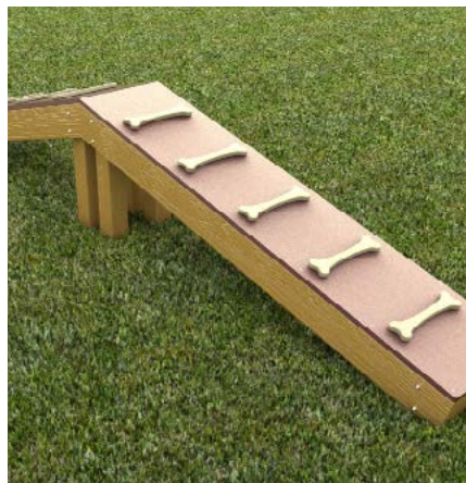
CAMEL HUMP CLIMBER RECFO001XX $2,541