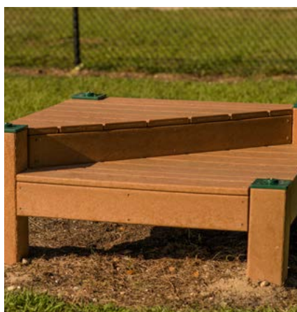
CLIMB AND SIT RECFO002XX $924