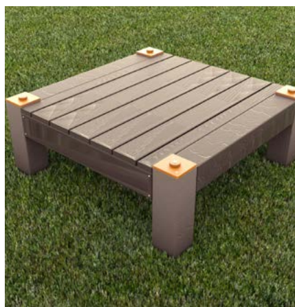
LET'S REST RECFO009XX $867