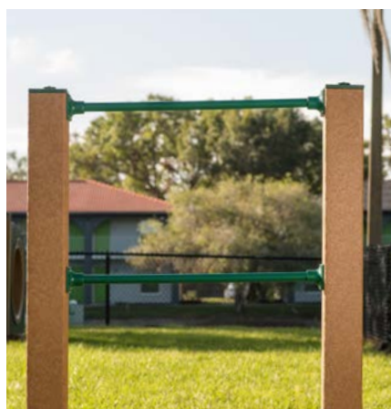
HIGH JUMP RECFO011XX $462