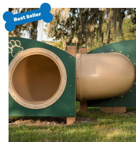
THROUGH THE TUNNEL RECF0004XX $2,253