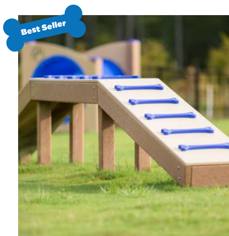
WALK THE PLANK RECFO015XX $3,386