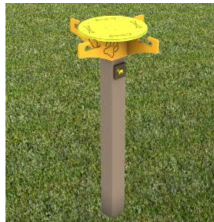
LEASH HOLDER RECFO022XX $384