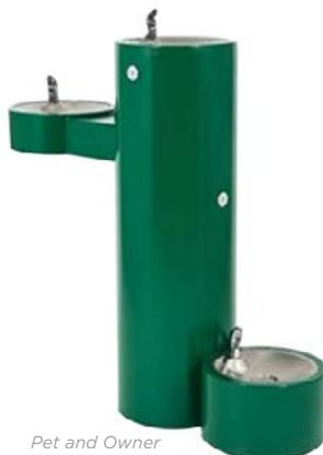
Pet and Owner