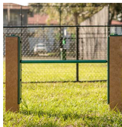
LIMBONE, ANYONE? RECFO003XX $924