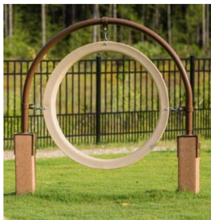
THROUGH THE TARGET RECF0006XX $982