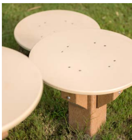
STEP UP RECFO005XX $924