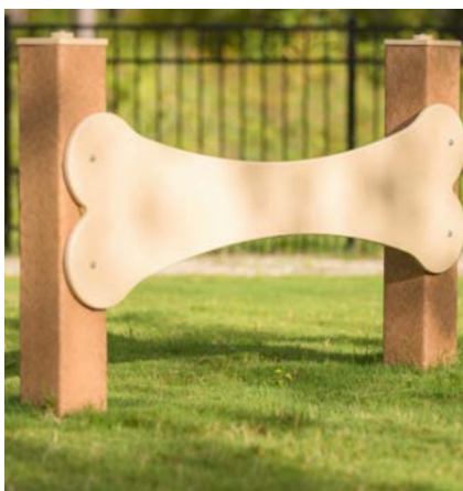
OVER AND UNDER RECF0012XX $363