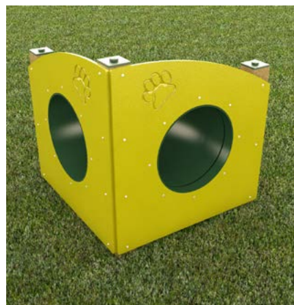
NICE TURN RECF0013XX $1,500